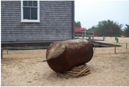
Nested Buoy, 2022 Manila rope, hemp rope, found buoy

Found on-site among tall grasses, this beautifully patinated iron buoy is a time-worn nautical guide nested on over 600 feet of heavy-gauge marine rope, providing a much deserved pedestal as a resting place of recognition.