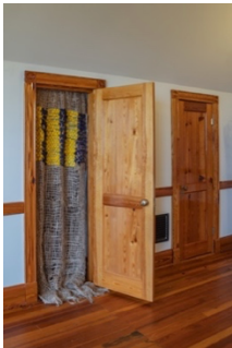
We Require a Pilot, 2022 Wool, jute netting

Found on-site among tall grasses, this beautifully patinated iron buoy is a time-worn nautical guide nested on over 600 feet of heavy-gauge marine rope, providing a much deserved pedestal as a resting place of recognition.